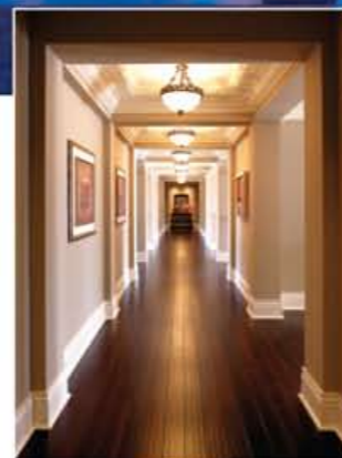
Upstairs, the bedrooms are accessed through this central hallway.

The second floor has four bedroom suites, each with a walk-in closet and private bath. One has a private morning bar and balcony, while the child's bedroom has a wraparound balcony that adjoins an activity room with another bath and an entertainment center for video games. In the 20 x 30-foot formal living room, exposed cypress trusses accent a two-story ceiling. French doors add warmth to the space, while allowing good waterfront views.