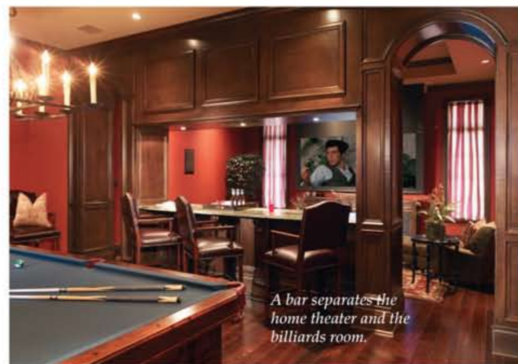
A bar separates the home theater and the billiards room.

The Windstar Design Group, a division of Windstar Homes, decorated the house in shades of brown, from linen to cocoa, and used gold travertine flooring throughout the home, the loggia and around the 5,000 square-foot of pool deck.