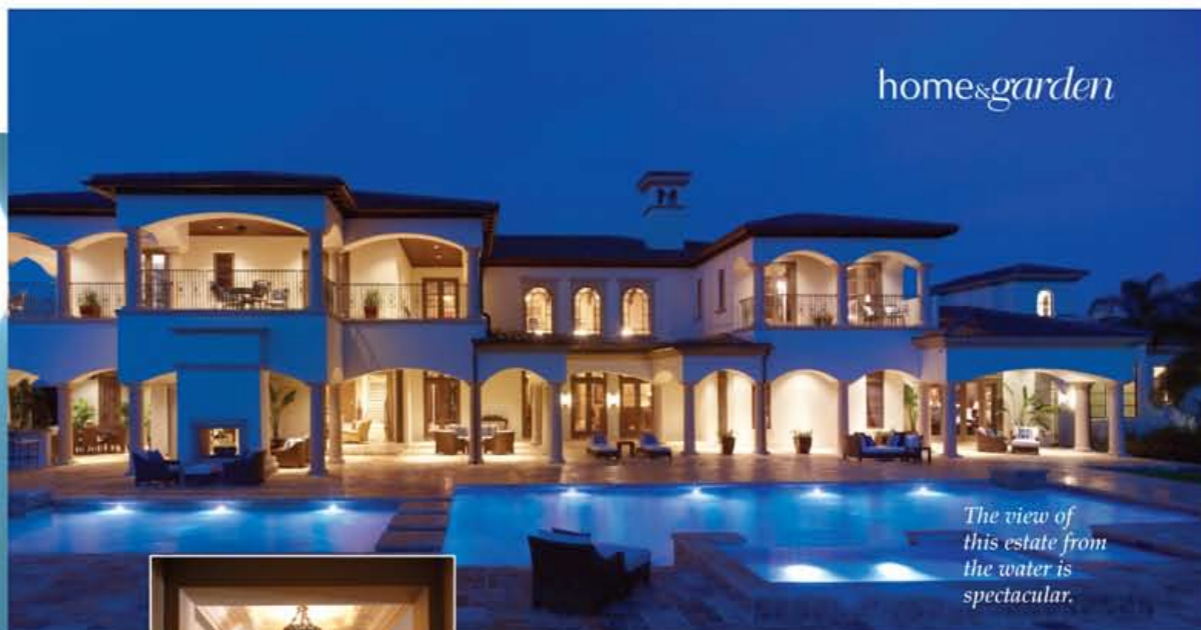
The view of this estate from the water is spectacular.