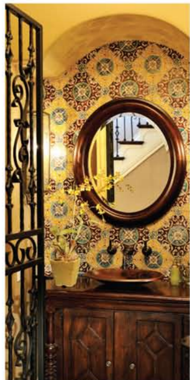
• This powder room reflects the Moorish influence that Windstar evoked in its design.

Windstar Homes is known for their distinct customized architectural and design details.